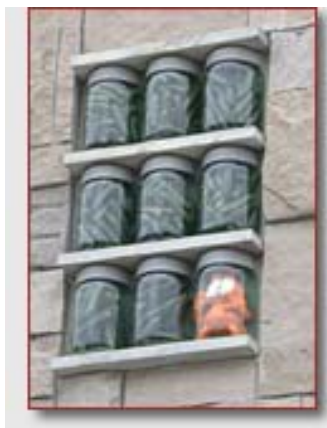
The Art of the 92 County Walk (Indiana State Museum building photography © Jeff Goldberg/Esto)

Production capacity to grow significantly over current volumes without any additional requirements for building or equipment.