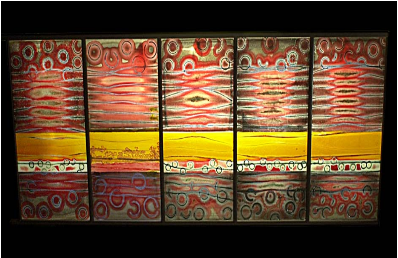
Venetian Architectural Panel on Display in the Kentucky Art and Craft Foundation Gallery, 608 Main Street, Louisville, Kentucky. Fused and colored panels with inclusions. Approximately 7' x 3' x 3/8".

We are proud to say that all of our products are made in America.